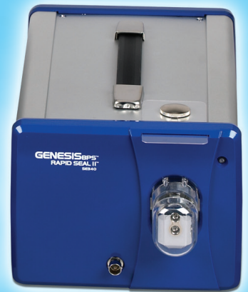
RAPID SEAL II™ SE330 & SE340 STANDARD BENCHTOP UNIT

Component processing is too important to leave to chance.