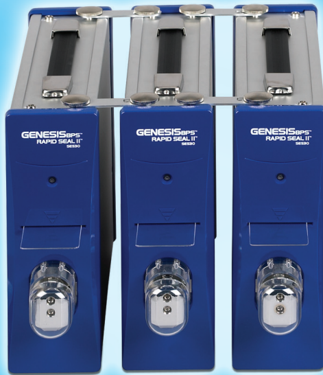
RAPID SEAL II™ SE530 MULTI-HEAD SEALER