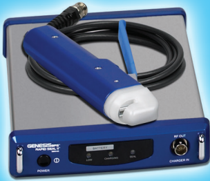
RAPID SEAL II™ SE640 PORTABLE UNIT