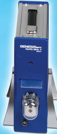
RAPID SEAL II™ SE540 SPACE SAVING BENCHTOP SEALER