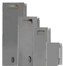
Blood bag cassette