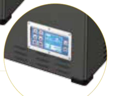
Smart Digital Control Panel