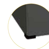
High quality cabinet material protect against deforming