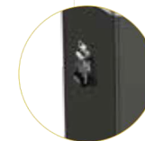
Removable metal handle