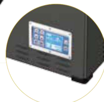
Smart Digital Control Panel