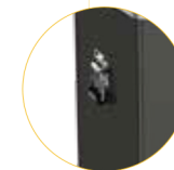
Removable metal handle