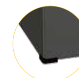
High quality cabinet material protect against deforming