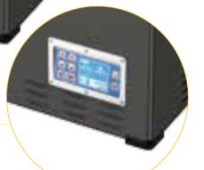
Smart Digital Control Panel