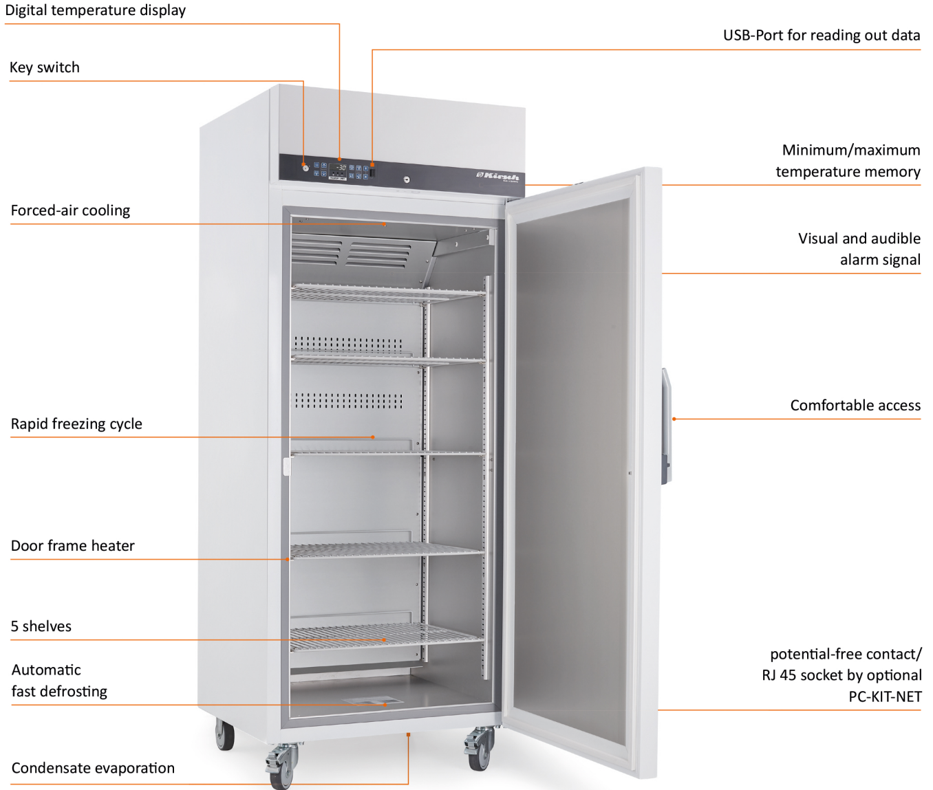
FROSTER LABO 530 PRO-ACTIVE